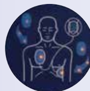
Visual cues prompt pad placement

Always ready. A System Status Ready Indicator flashes to show that the complete system is operational and ready for use. The device automatically runs self-check each week.